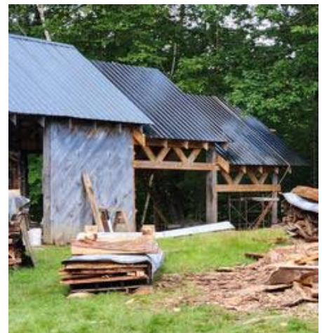
The roof is on! August 26, 2023

All levels of experience welcomed. Every time we meet to work on this project, there is a joyful feeling of working together for a common purpose.