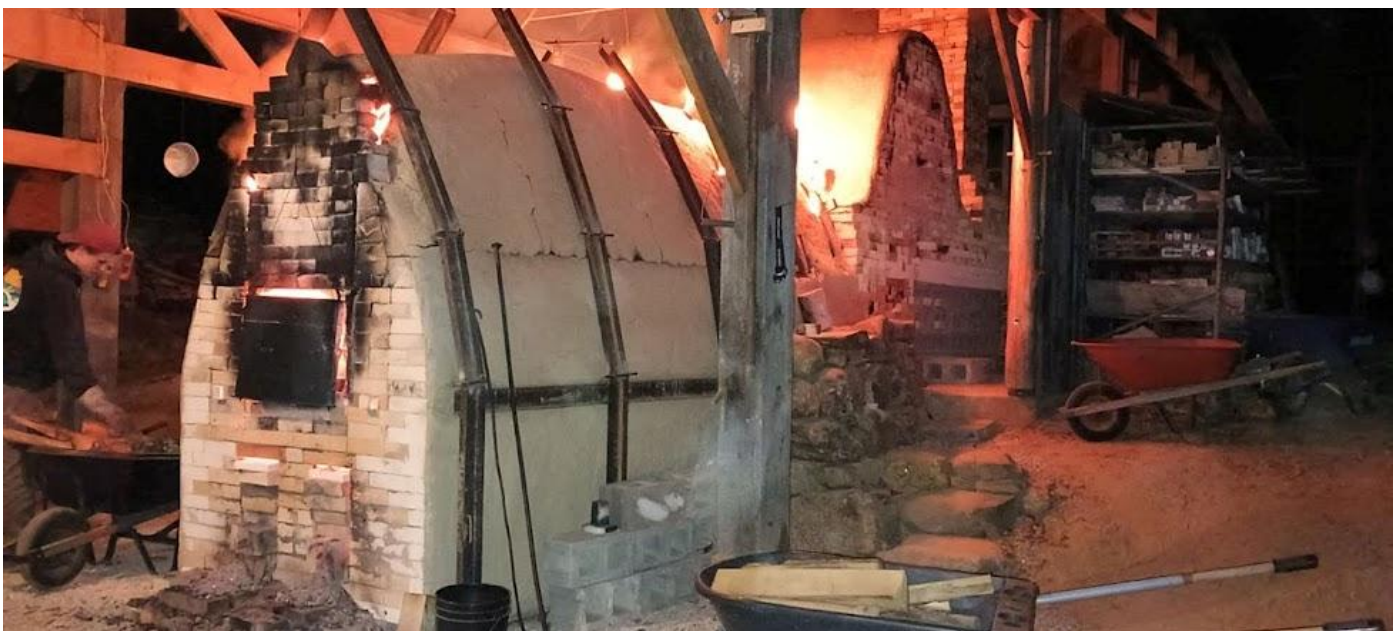
NAKAMAGAMA in Action