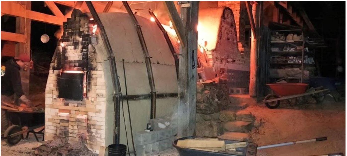
NAKAMAGAMA in Action